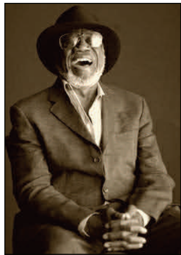
Just Jazz Artist of the Month singer Bill Henderson