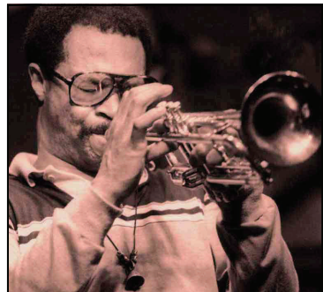
Just Jazz Artist of the Month trumpeter Woody Shaw