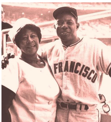
Two Giants: Ella and Willie

2017 marks the 100th birthday anniversary of the great Ella Fitzgerald. I am celebrating Ella and her music all year long on Just Jazz featuring The Sinatra Hour . And on April 23th — the Sunday before Ella's birthday — The Sinatra Hour will become, for that day, The Ella Hour .