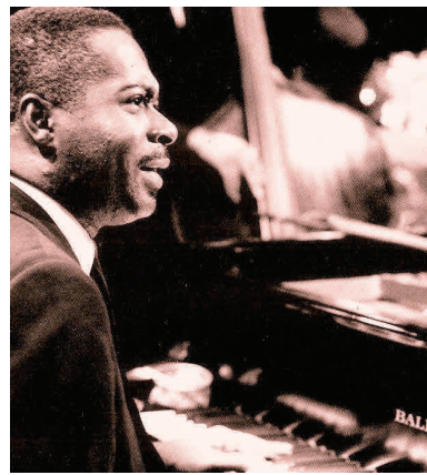
Just Jazz Artist of the Month pianist Wynton Kelly