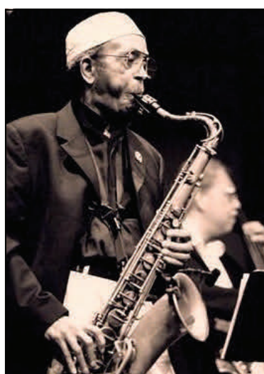
Just Jazz Artist of the Month tenor saxophonist Jimmy Heath