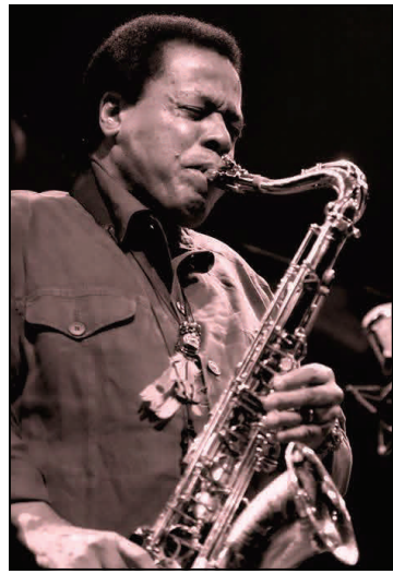
Just Jazz Artist of the Month saxophonist Wayne Shorter