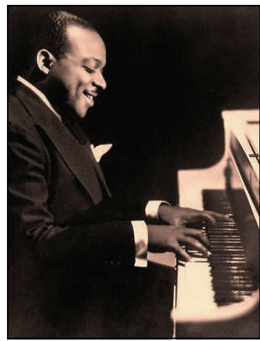
Just Jazz Celebrates the 110th Birthday of Count Basie