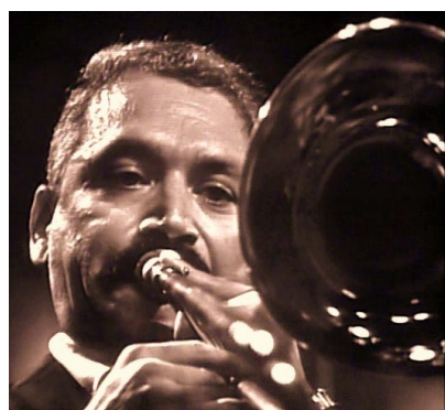
Frank Rosolino Born August 20, 1926