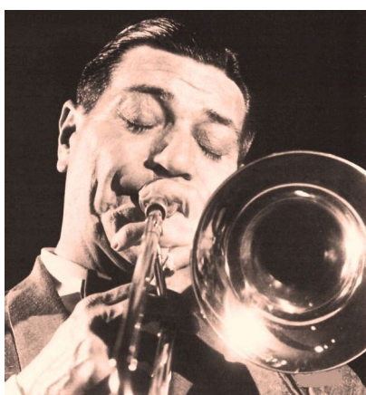
Jack Teagarden Born August 20, 1905