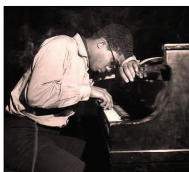
Just Jazz Artist of the Month pianist Herbie Hancock