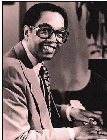
Just Jazz Artist of the Month pianist Billy Taylor