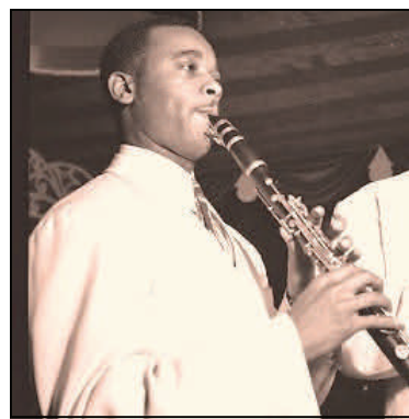
Just Jazz Artist of the Month clarinetist Jimmy Hamilton