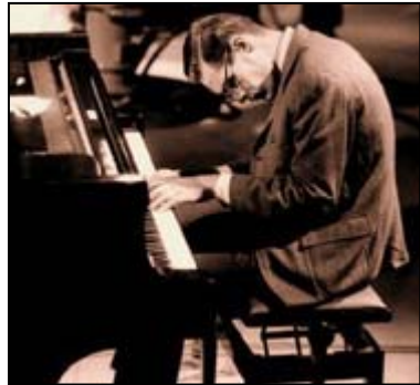
Just Jazz Artist of the Month pianist Bill Evans