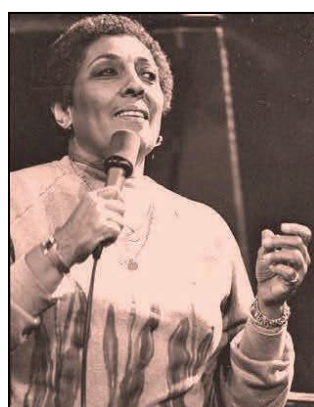
Just Jazz Artist of the Month singer Carmen McRae