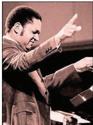
Just Jazz Artist of the Month saxophonist-composer Oliver Nelson