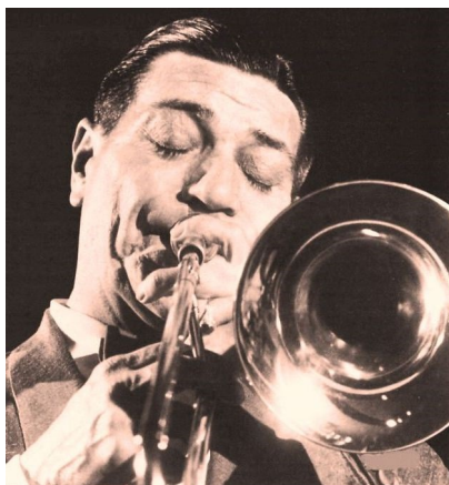
Jack Teagarden Born August 20, 1905