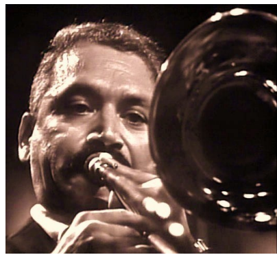
Frank Rosolino Born August 20, 1926