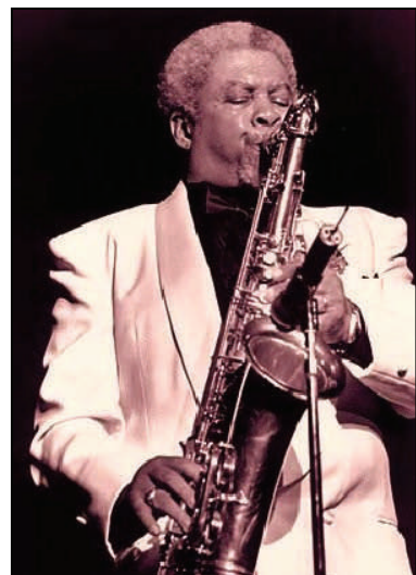
Just Jazz Artist of the Month tenor saxophonist-composer- arranger Frank Foster