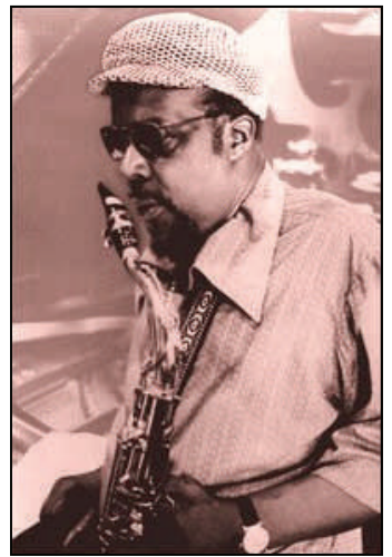
Just Jazz Artist of the Month tenor saxophonist Gene Ammons